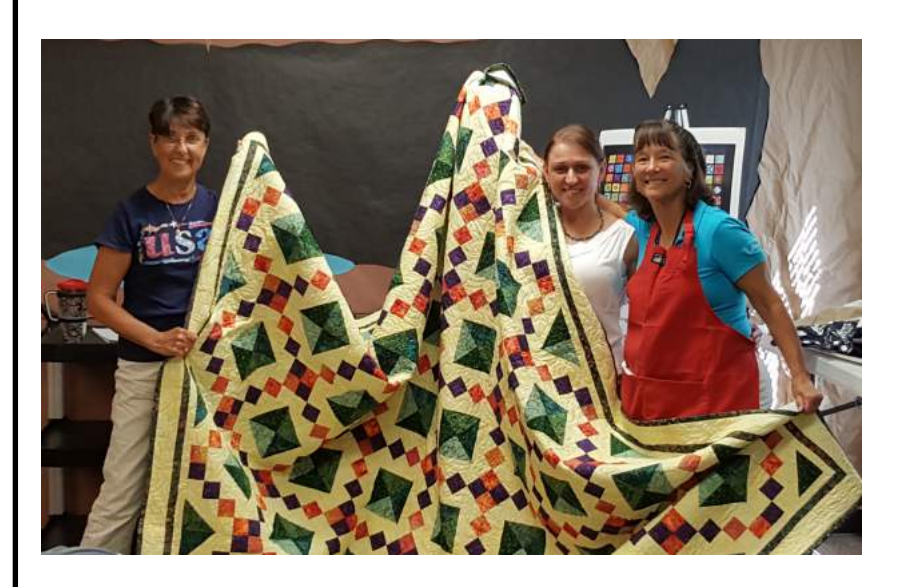
***QUILTED GRATIS BY SARAH'S THIMBLE.